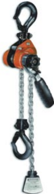
1100 LB. Capacity

Designed for close quarter, standard duty commercial applications. Short handle with low pull requirement makes these units easy to operate.