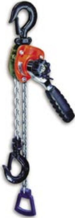
550 LB. Capacity