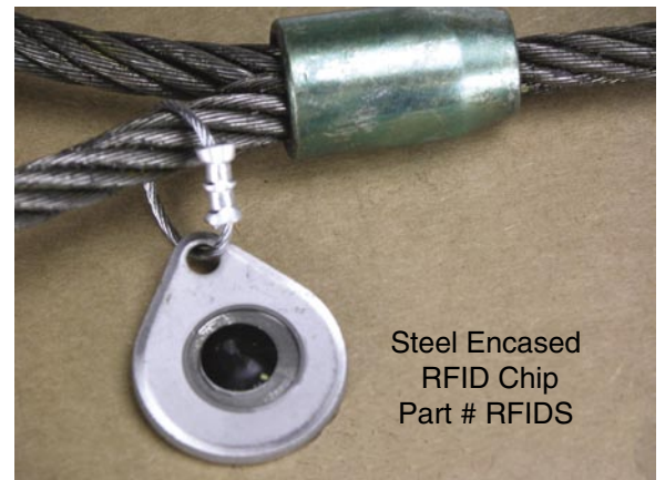
Steel Encased RFID Chip Part # RFIDS

Wire rope and chain slings are offered with a high frequency, RFID chip permanently set into a machined, teardrop shaped piece of steel, attached to the sling with a wire cable. Wire rope sling placement is between the Tuff-Tag and the swaged sleeve. Chain sling attachment is beside the I.D. tag on the connector link.