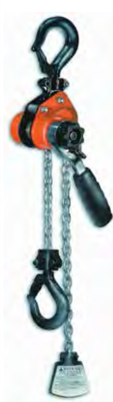
1100 LB. Capacity

Designed for close quarter, standard duty commercial applications. Short handle with low pull requirement makes these units easy to operate.