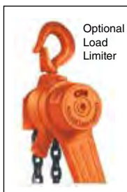
Optional Load Limiter

Stops excessive lever force from being transmitted to the PULLER.