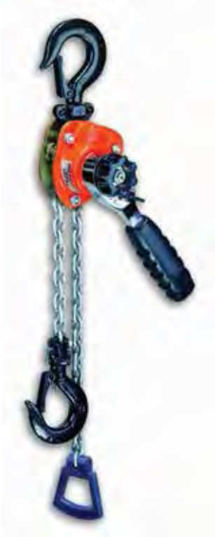
550 LB. Capacity