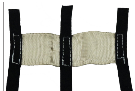
Open Shackle Pad