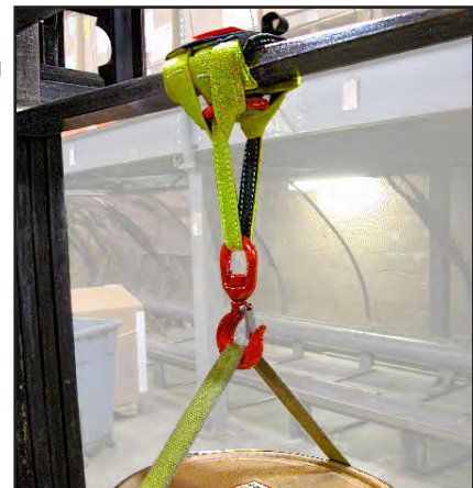
Shown With Optional Lanyard Part Number: 60111