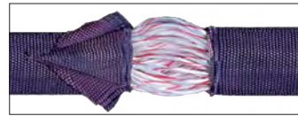
Tuflex (Side View)